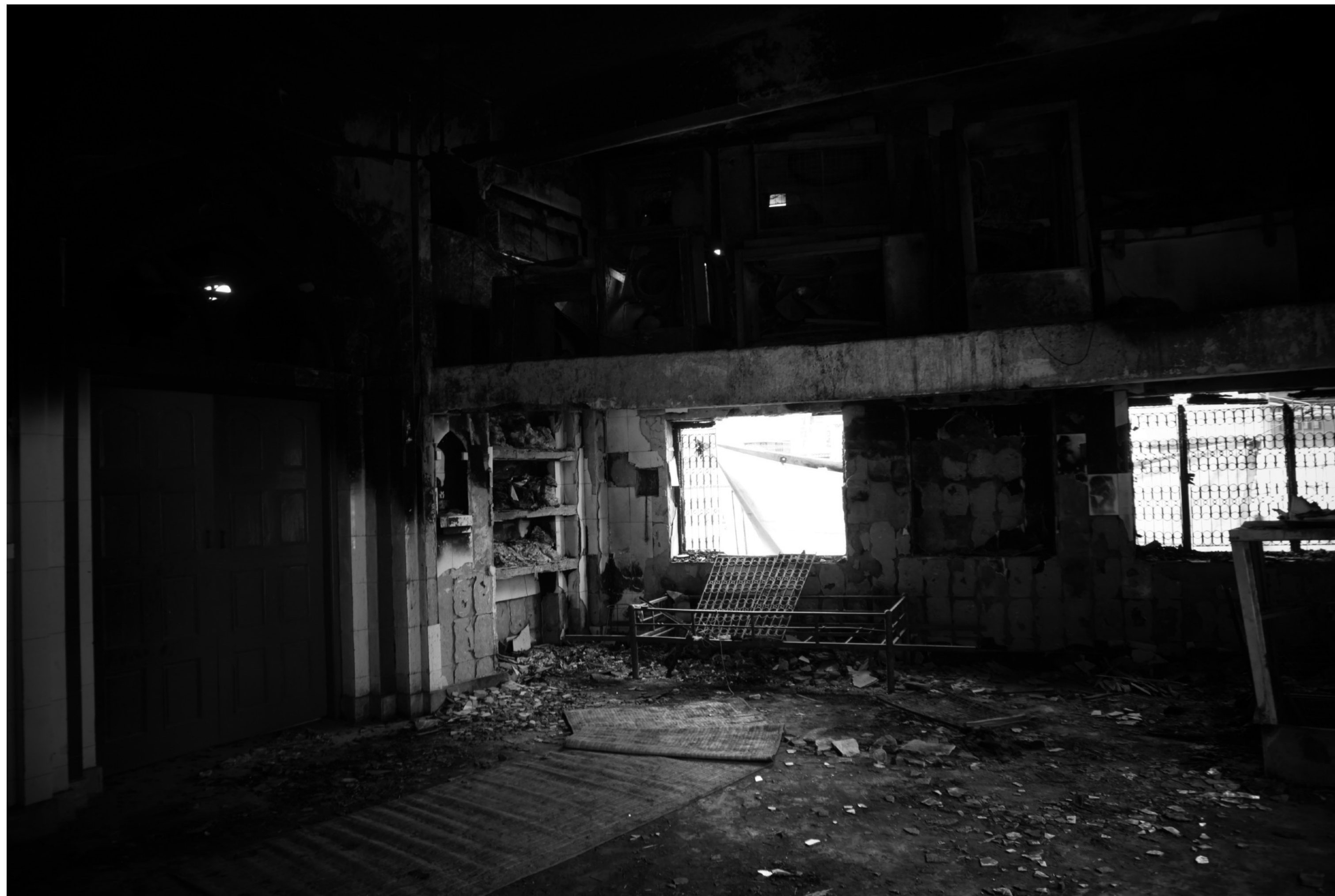
Inside view of Masjid-e-Furqania that was burnt down by a mob.