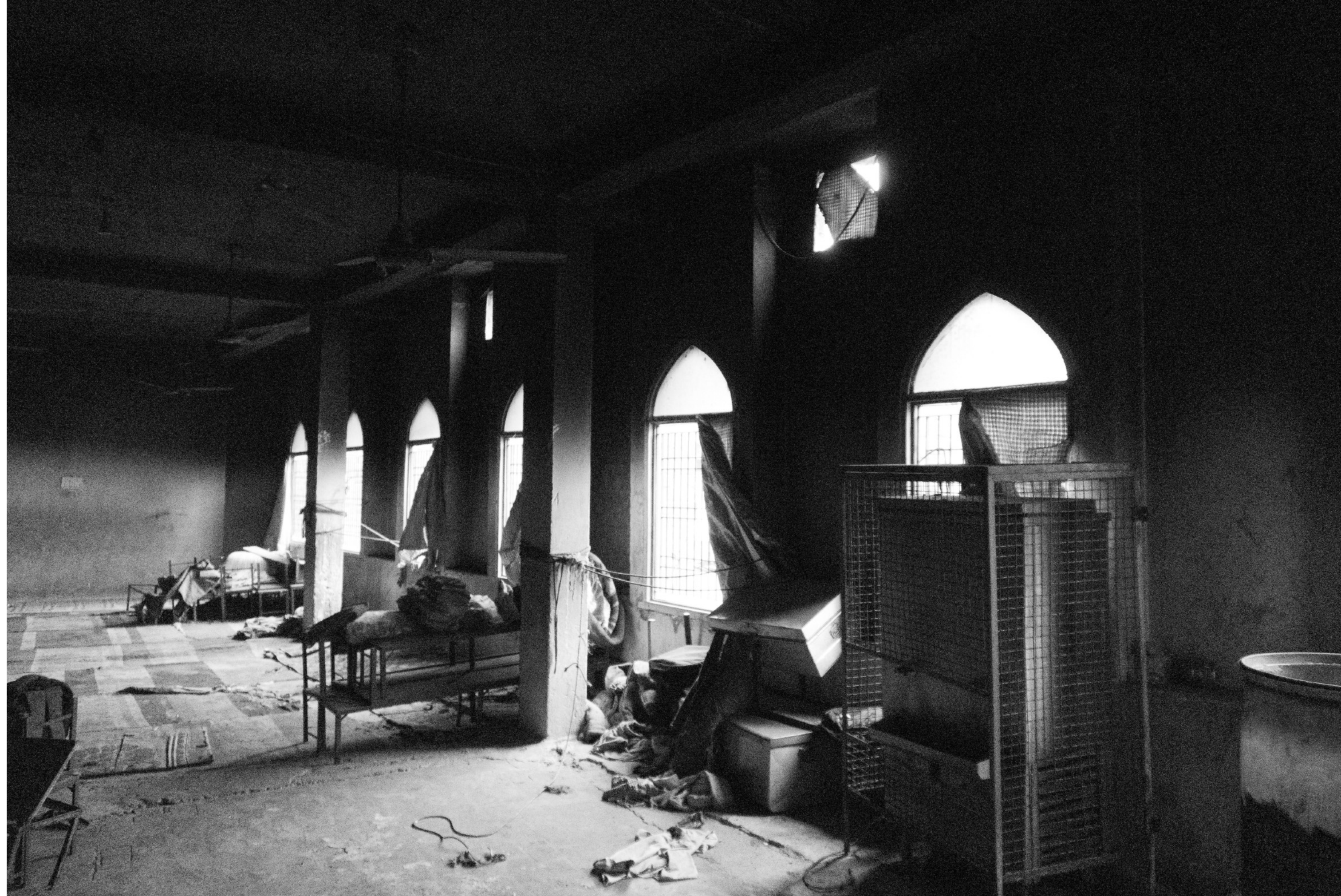
The madrasa that functioned on the first floor of Masjid-e-Furqania in the aftermath of destruction and fire.