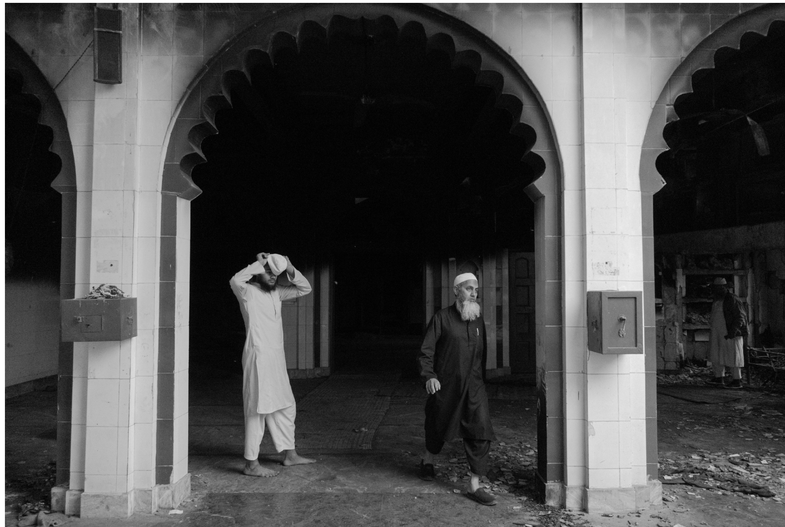
Two men leaving the central hall of masjid. Arches covered in soot is seen in the background.