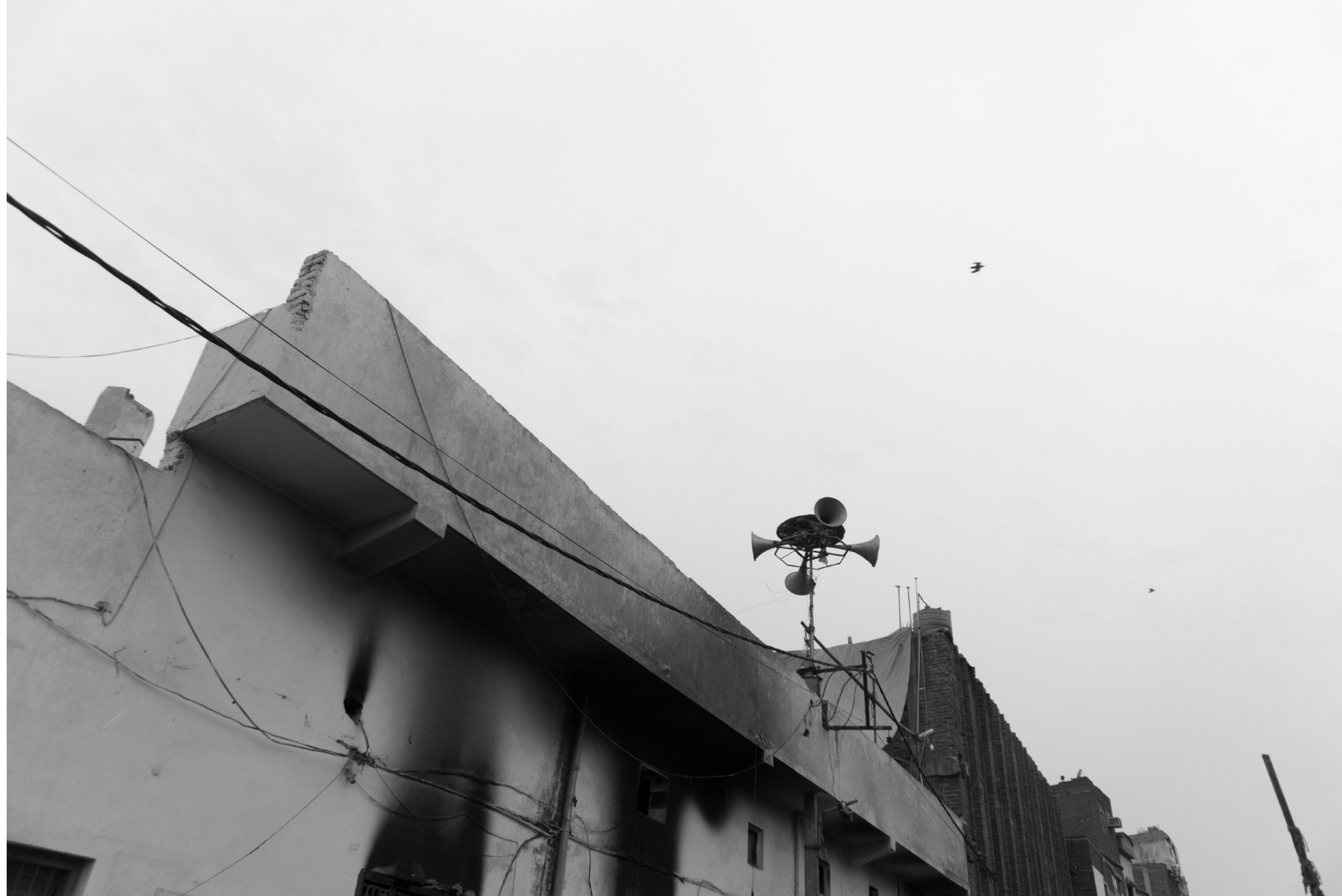
Loud speakers fixed on a pole on the terrace of the masjid. Exterior wall of the masjid covered in soot is also seen.