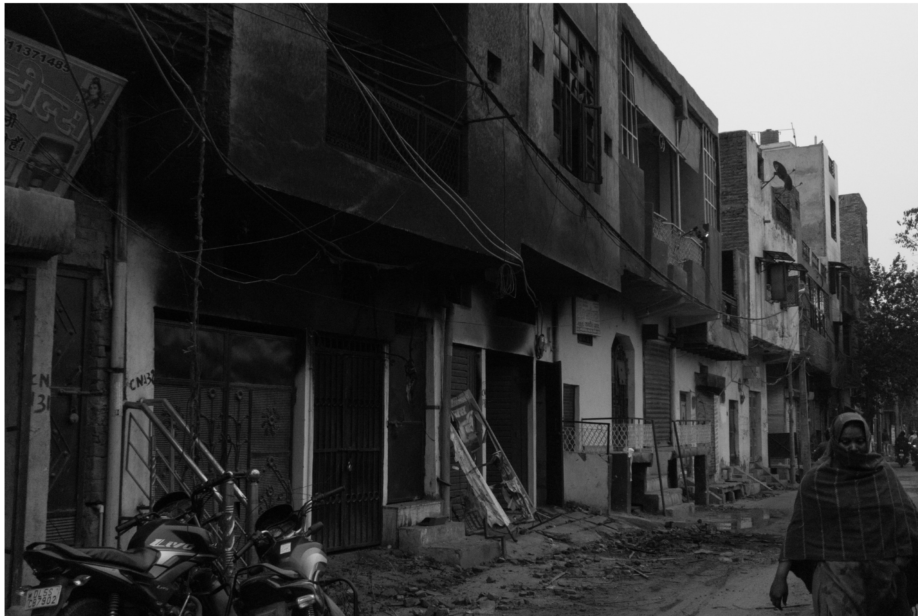
Muslim houses were targeted while others left untouched.