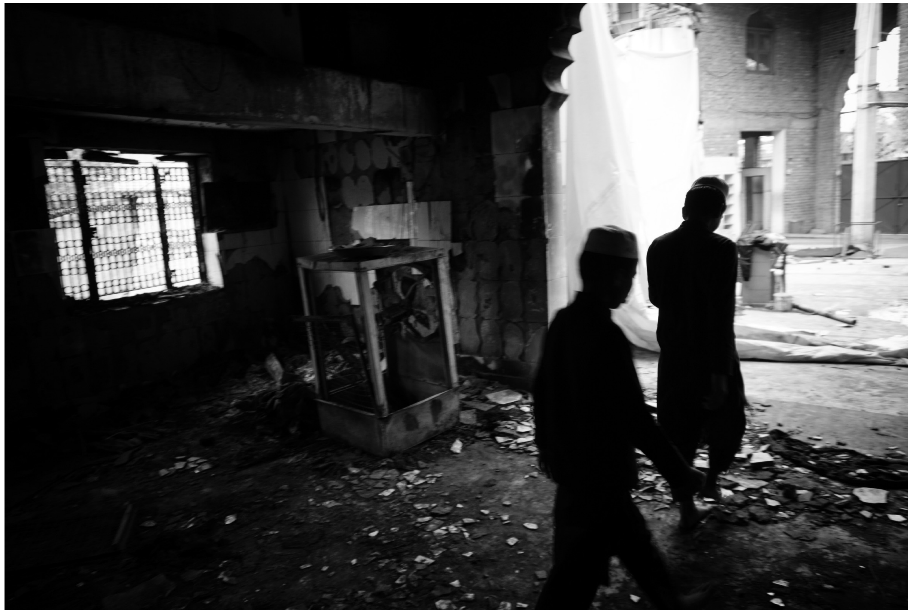
Two young boys walk in between the rubbles and charred remains.