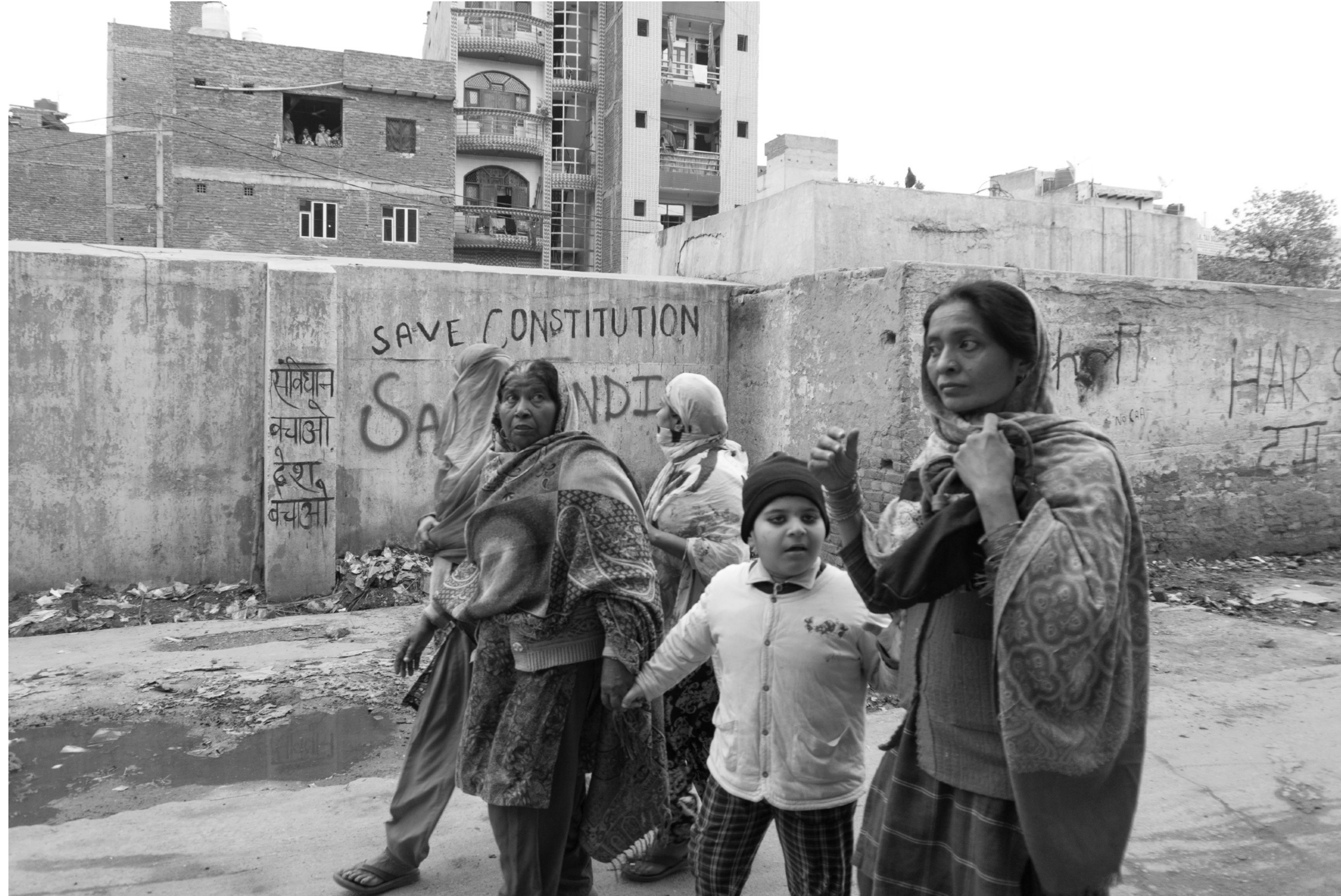
People passing by Masjid-e-Furqania and looking at the charred remains. The boundary wall in the background has a slogan that reads, 'Save Constitution, Save India'.