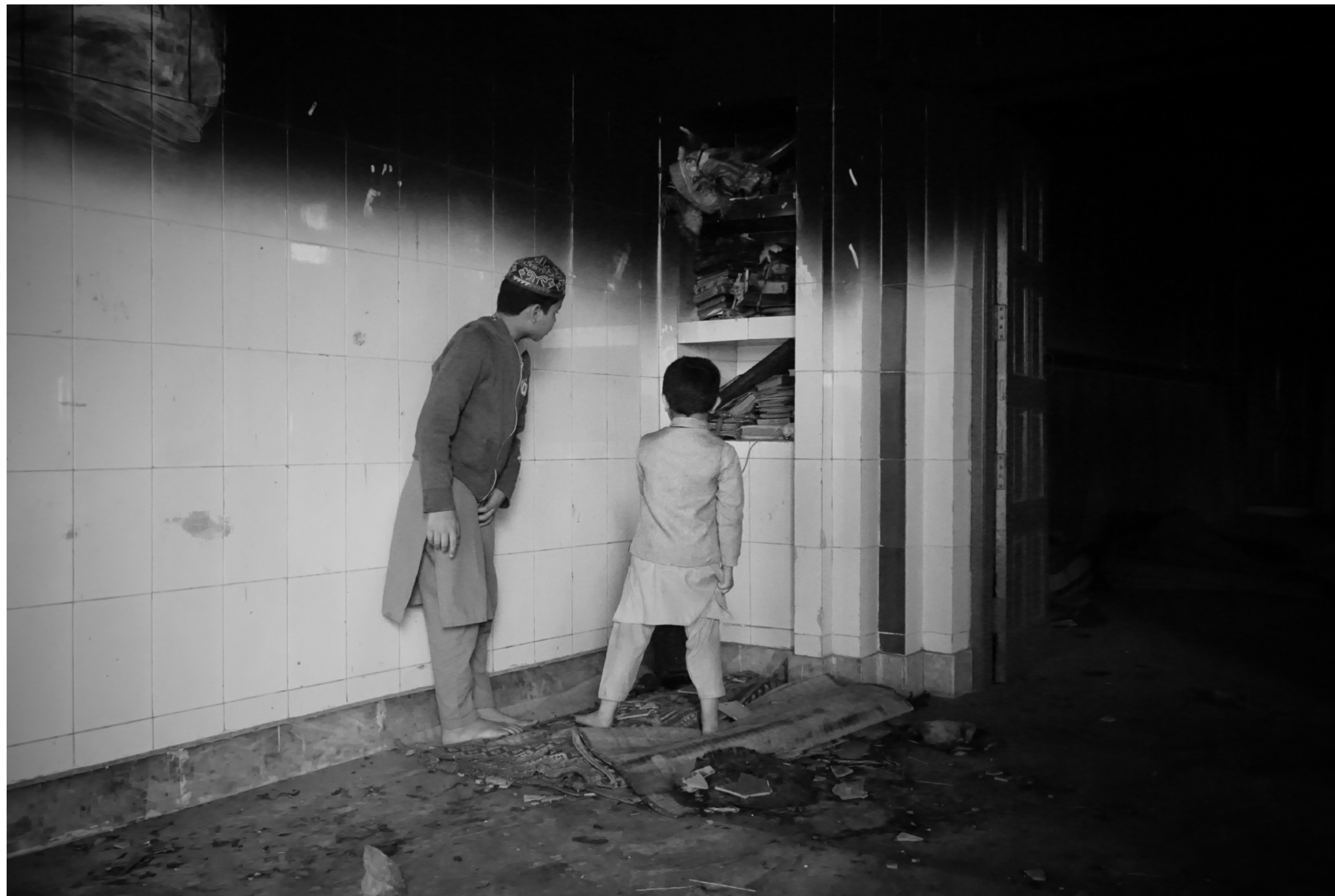
Two young boys checking out a half-burnt shelf. Torn and dusted prayer rug is also seen on the floor.