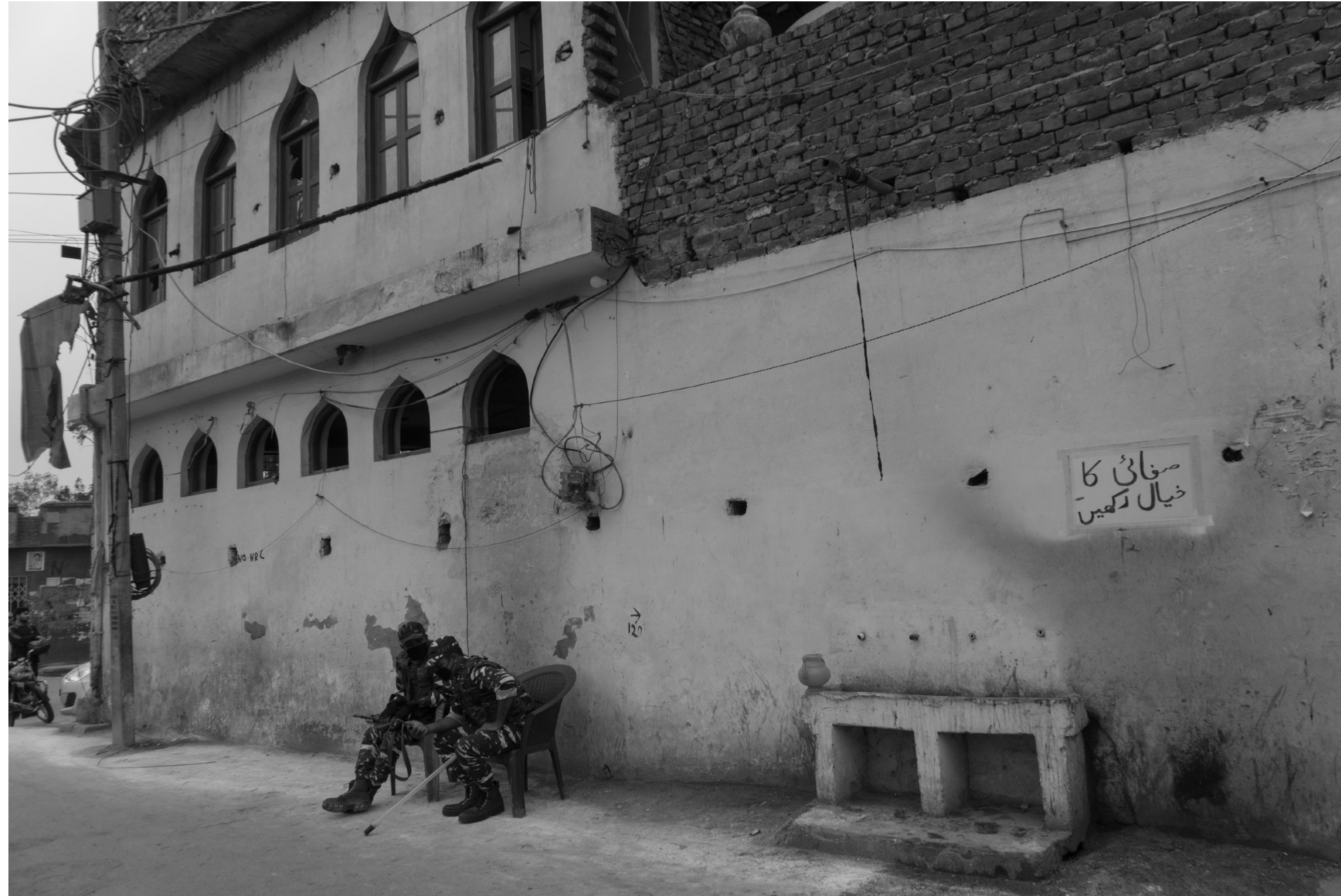
Paramilitary personnel sitting outside Masjid-e-Furqania.